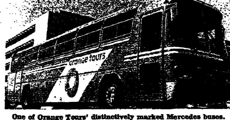
One of Orange Tours' distinctively marked Mercedes buses.